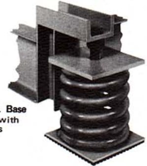
Type WFSL Base WF Frame with SLF Mounts

All bases may be furnished with built-in motor slide rails.